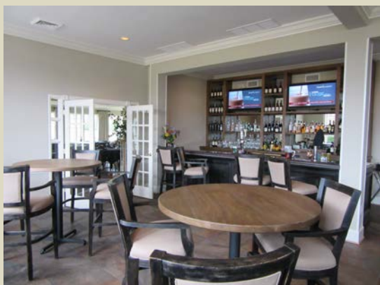
New Bar & Grill Area

"The most important shot in golf is the next one."